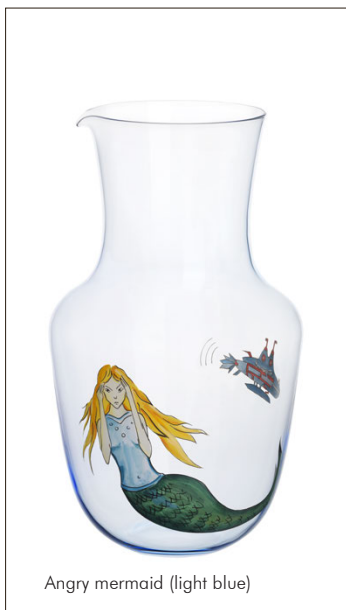
Angry mermaid (light blue)