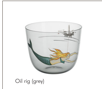
Oil rig (grey)