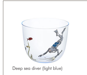
Deep sea diver (light blue)