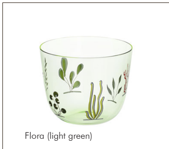
Flora (light green)