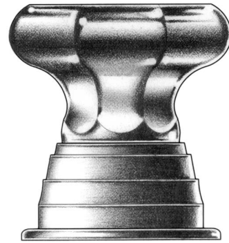
SIZE L 2 1/4 inch Diagonal