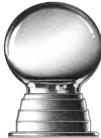
SIZE L 2 inch Diameter