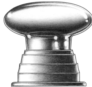
SIZE L 2 1/4 inch Diameter