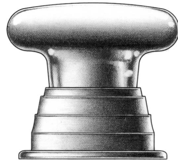
SIZE L 2 1/4 inch Diameter