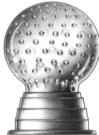
SIZE L 2 inch Diameter