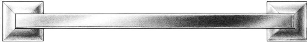
L (4 1/2")