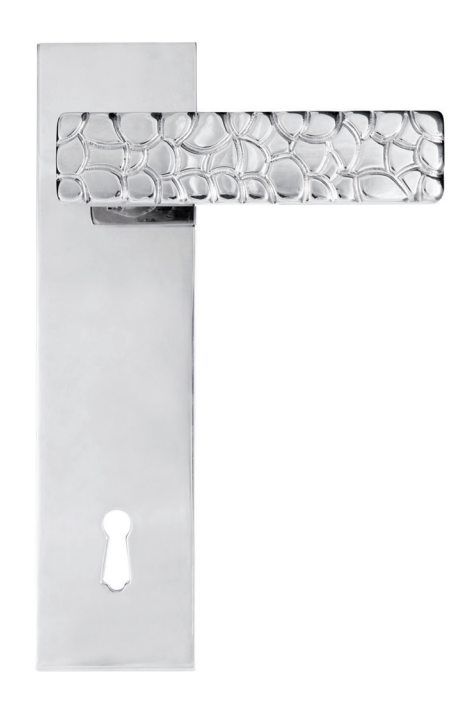
PULL HANDLE 7002