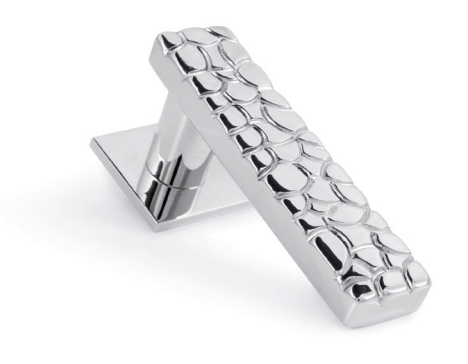
LEVER HANDLE 7002 ON ROSE 1000