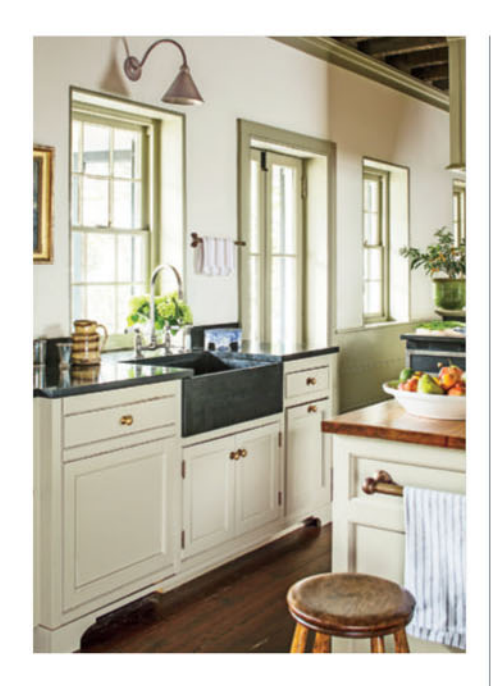
THE PREP AREA The sink and its companion cabinetry protrude slightly and have "feet," lending a furniture feel. A black granite farm sink offers the look of period-appropriate soapstone and integrates seamlessly with the countertops.

APPROPRIATE MATERIALS, AGED FINISHES, AND HIDDEN STORAGE CREATE A PERIOD LOOK WITH MODERN FUNCTION