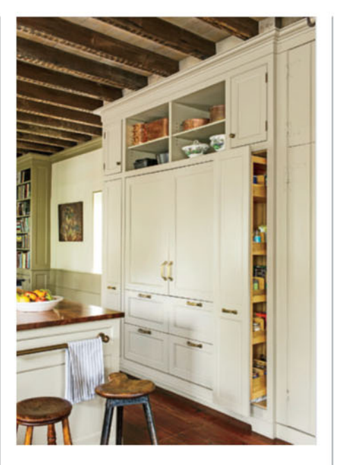
THE PANTRY WALL Two pull-out pantries flank the refrigerator; all three are hidden behind recessed-panel millwork. "In the 19th century, kitchens didn't have modern appliances, so we made it to hide all that stuff," says Gil.