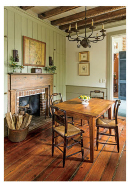
THE BREAKFAST ROOM Gil varied the direction of the new paneling and wainscot to create the illusion of age, "because back then, there weren't kitchen designers, just some guys with some wood," he says.