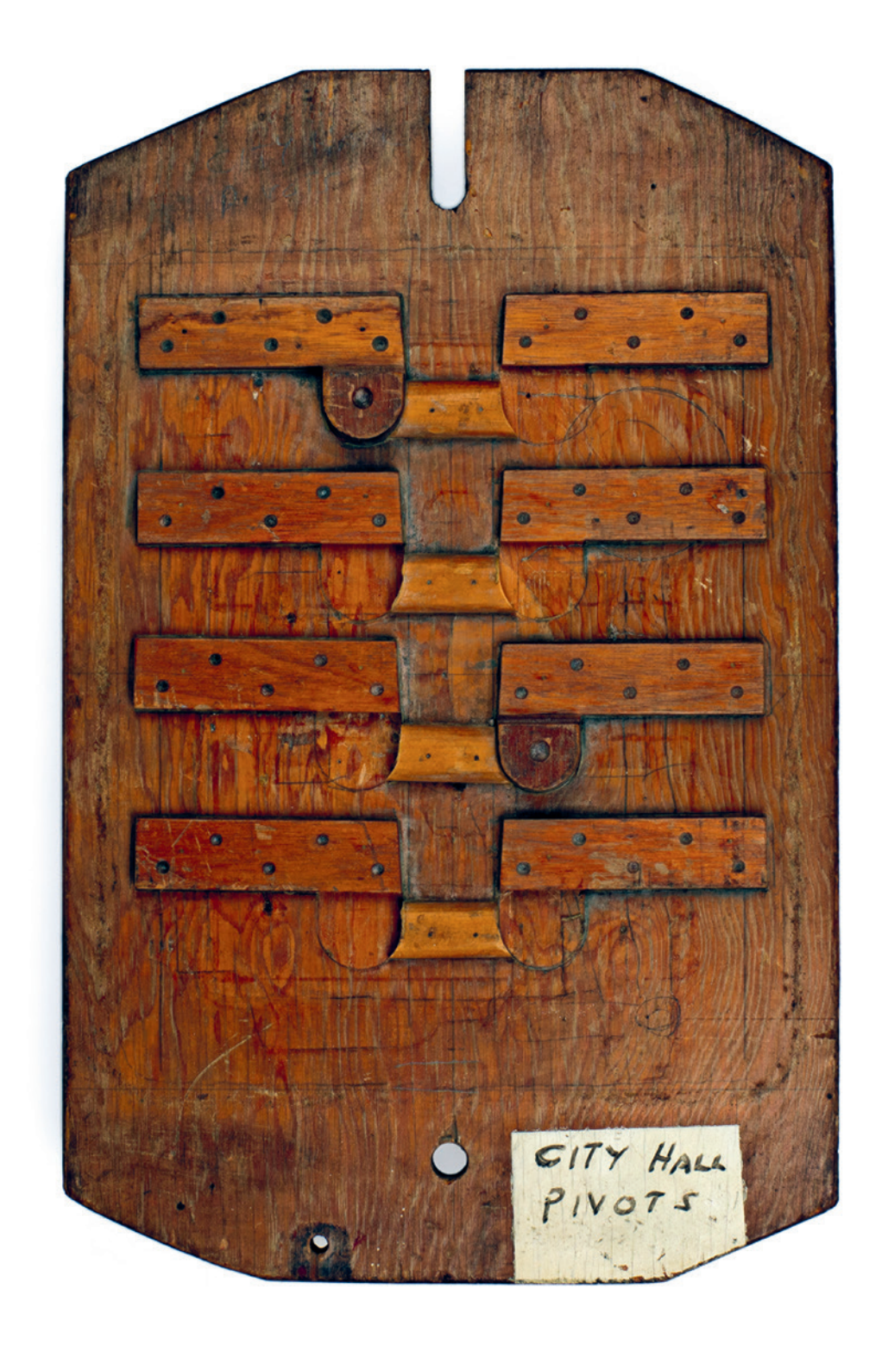
"CITY HALL PIVOTS" Pattern Board for the New City Hall, Boston, Massachusetts The W.C. Vaughan Co., 1967–1968