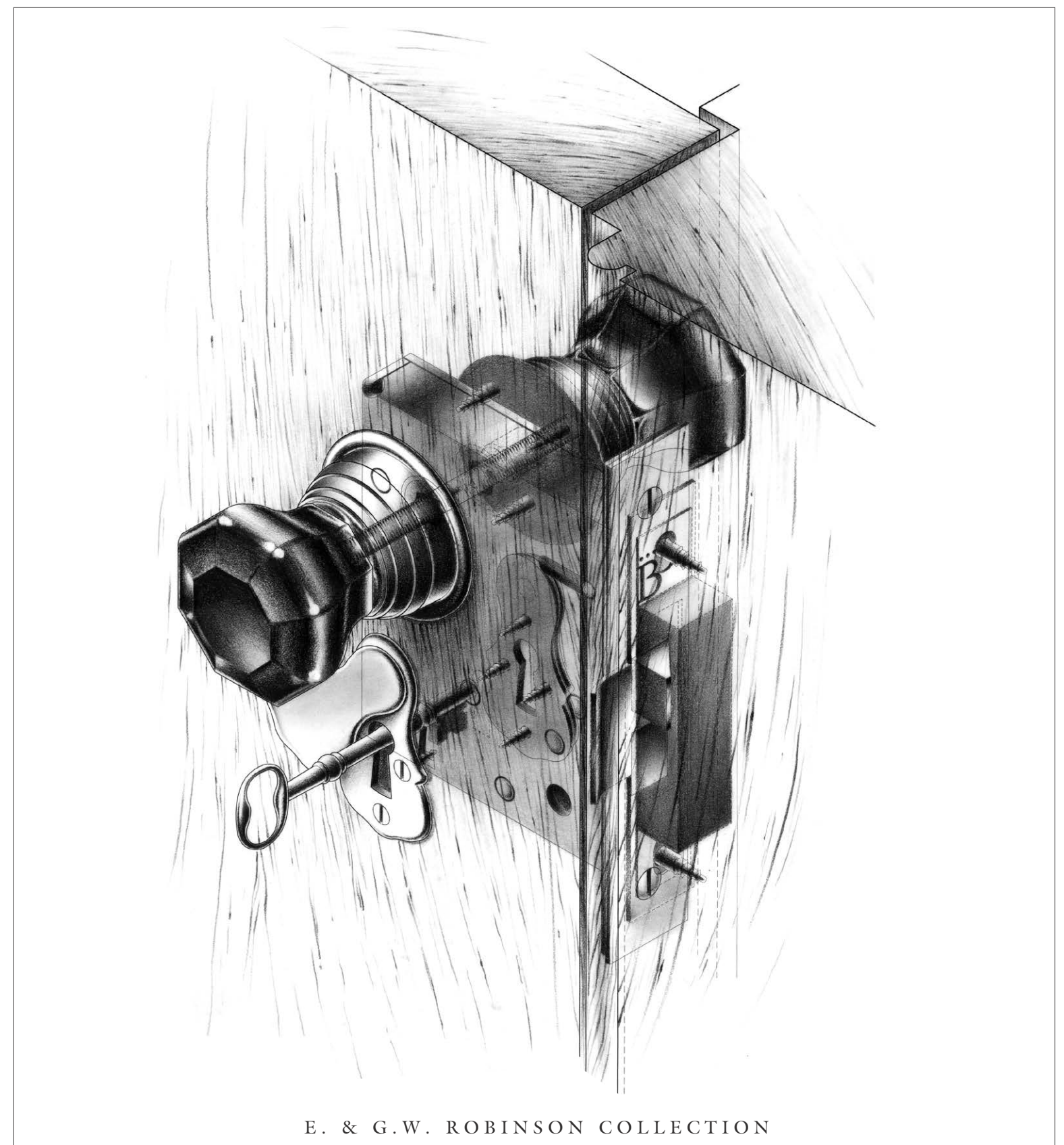
E. & G.W. ROBINSON COLLECTION GH Design Series Pressed & Hand-Ground Black Crystal Door Knobs & Eschutcheons Patterned after E. & G.W. Robinson's Mechanical Patent of 1837