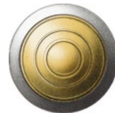
Cylindrical Floor Stop with Trim Ring