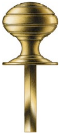
Thumb Turn & Rose