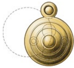
Emergency Trim Ring with Swinging Cover