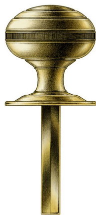
Thumb Turn & Rose