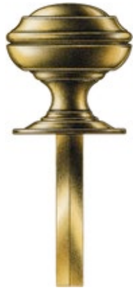
Thumb Turn & Rose