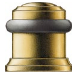
Cylindrical Floor Stop with Trim Ring