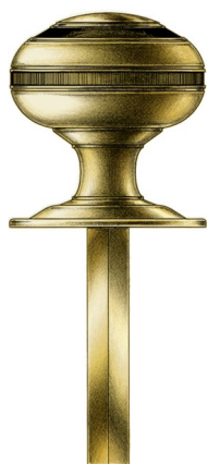
Thumb Turn & Rose