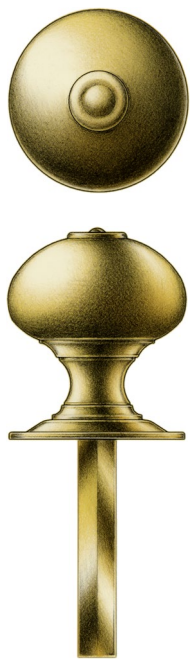
Thumb Turn & Rose