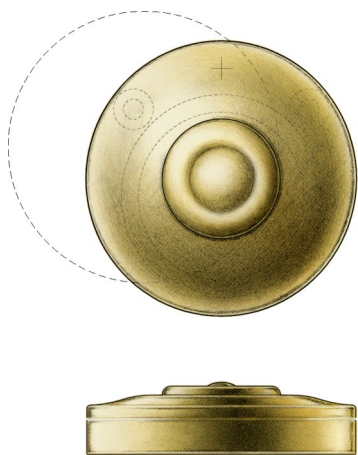
Cylinder Ring with Swinging Cover