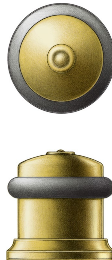
Cylindrical Floor Stop with Trim Ring