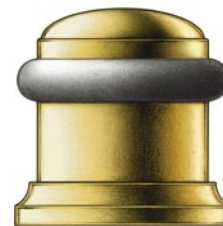
Cylindrical Floor Stop with Trim Ring