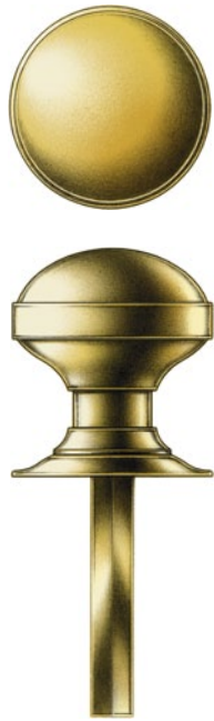
Thumbturn and Rose