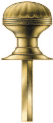
Thumb Turn & Rose