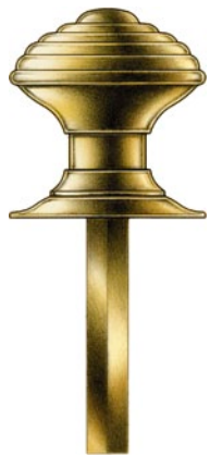
Thumbturn and Rose