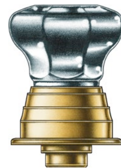
2" Crystal Knob Shown with Robinson (Stepped) Shank