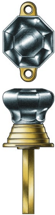
Crystal Thumbturn and Rose