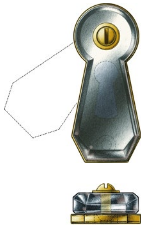
Key Escutcheon with Crystal Cover