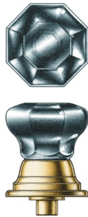
1 1/4" Crystal Cabinet Knob Shown with Nashua (Shell) Shank