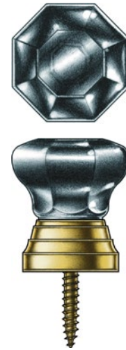
Crystal Shutter Knob Shown without Rose