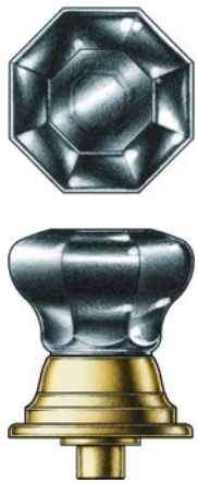
1 1/4" Crystal Cabinet Knob Shown with Nashua (Shell) Shank