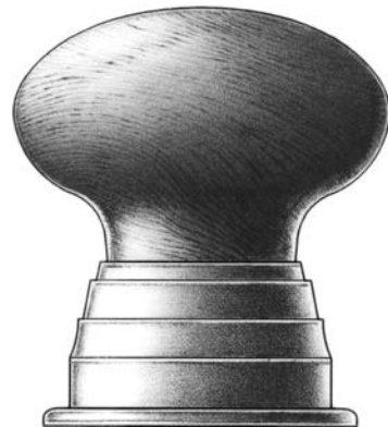
SIZE L 2 1/4 inch Diameter