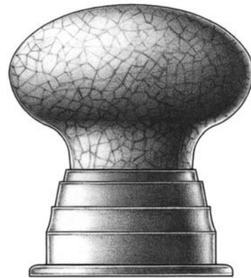
SIZE L 2¼ inch Diameter