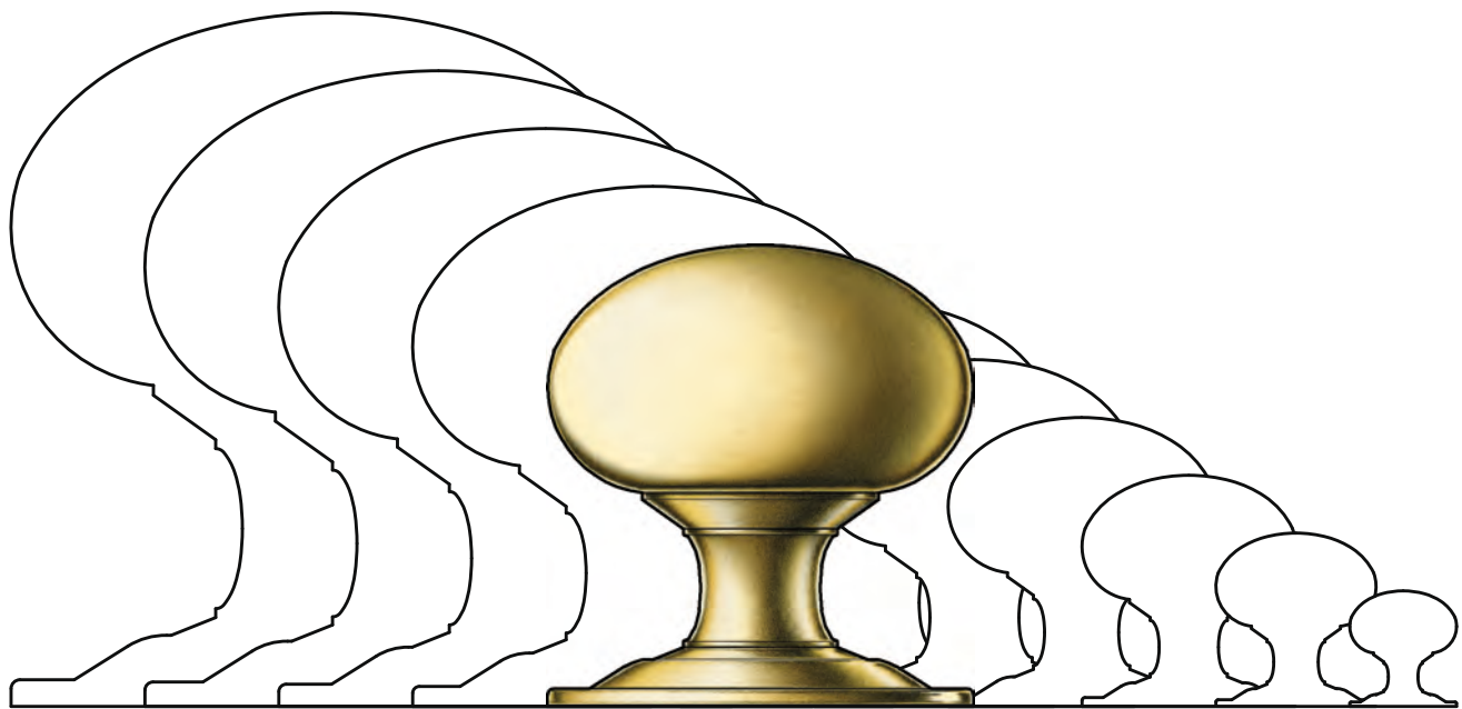
“VC” SERIES DESIGN SCALE