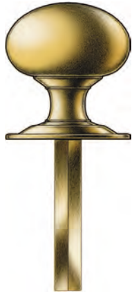
Thumb Turn & Rose