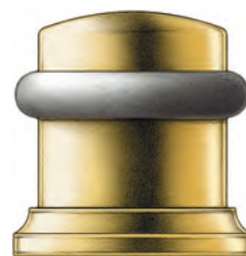
Cylindrical Floor Stop with Trim Ring