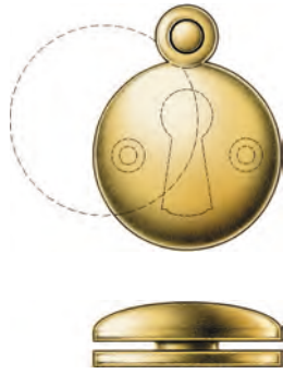
Emergency Trim Ring with Swinging Cover