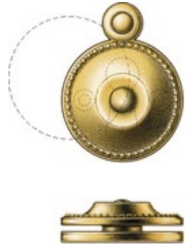
Emergency Trim Ring with Swinging Cover