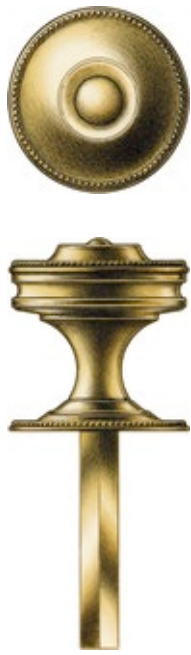
Thumb Turn & Rose