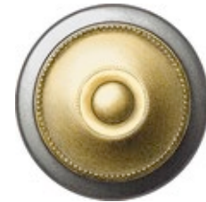
Cylindrical Floor Stop with Trim Ring