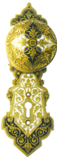
Above: rare antique enameled doorknob and escutcheon plate. Right: E. R. Butler & Co. has an eclectic array of antique and modern enameled porcelain and brass doorknobs and bells

A visit to the showroom in New York’s fashionable NoLita district proves that Butler succeeds wildly. After all, this is where medieval-looking doorknockers befitting the hand of Quasimodo keep company with sleek, stainless steel fixtures by modern industrial designers such as Philippe Starck and Jasper Morrison. It is where Venetian door pulls ripple and curl like tiny ocean waves next to faceted crystal doorknobs the size of grapefruit. It is a jewel box brimming with more than 120 drawers of the finest samples of art