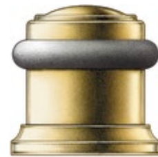
Cylindrical Floor Stop with Trim Ring