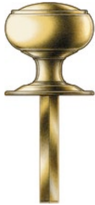
Thumb Turn & Rose