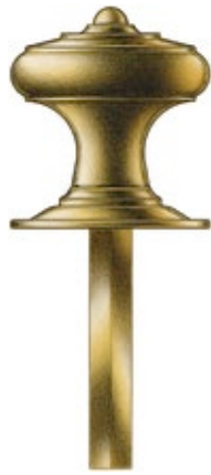
Thumb Turn & Rose