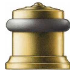
Cylindrical Floor Stop with Trim Ring